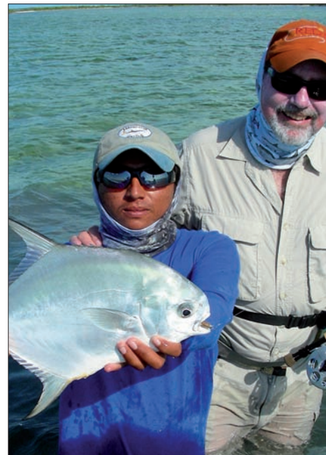
Ascension Bay, in Mexico, boasts “incredible bird watching and fishing” for a multitude of species including permit.

Washington State. Red’s has built an exceptional reputation in the flyfishing travel industry for trust and experience. During the winter months of January through March, Red’s schedules weekly trips, bringing eight to ten anglers at a time to Casa Viejo Chac, an all-inclusive lodge in Punta Allen.