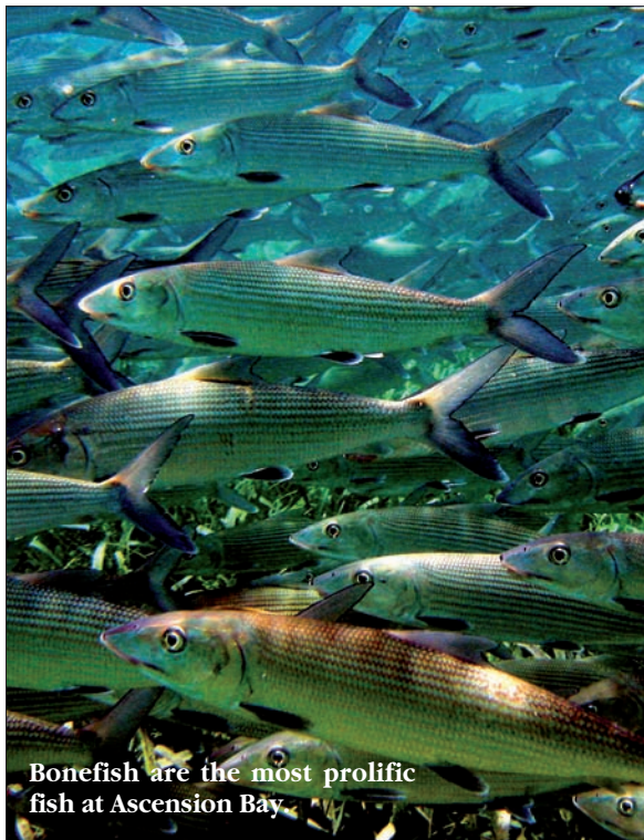
Bonefish are the most prolific fish at Ascension Bay.