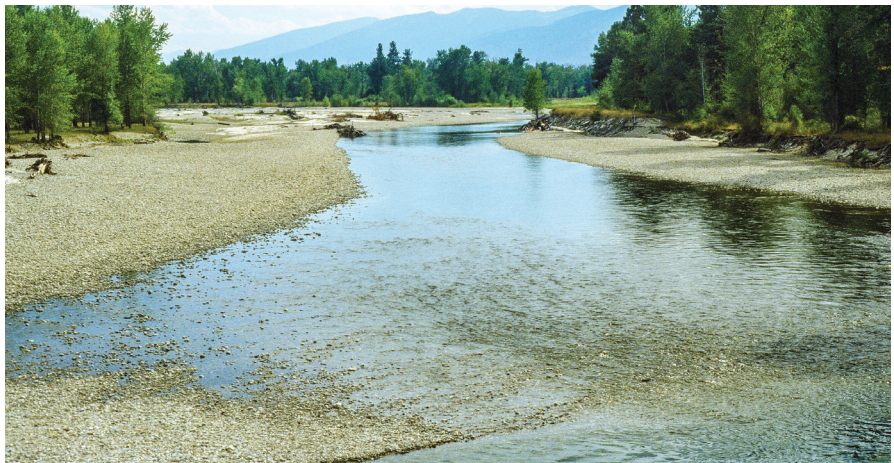
When the lower Bitterroot River was nearly devoid of water at the Bell Crossing access during the summer droughts of 1987 (top) and 1988 (bottom), stakeholders convened and formed a water allocation plan that recognized both the private and public value of the resource, and the need to protect the river's wild brown, cutthroat, and rainbow (below) trout populations.

water from the DNRC to add to the previous 5,000, bringing the total available to 15,000 acre-feet, where it remains today.