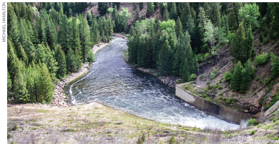
At full capacity, Painted Rocks Reservoir (top) can hold 45,000 acre feet of water, and because of the agreement in place, managers portion it out through a 143-foot high dam (bottom) throughout the year for both agricultural purposes and to add cool instream flows that help the Bitterroot's wild trout during years of low flows or high water temperatures.