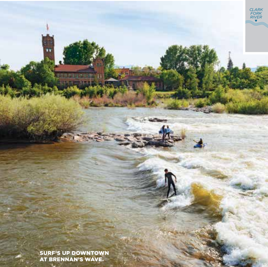
SURF'S UP DOWNTOWN AT BRENNAN'S WAVE.