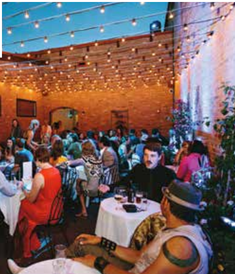
FIND ROOFTOP REVELRY AT PLONK.