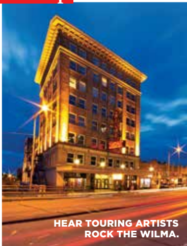
HEAR TOURING ARTISTS ROCK THE WILMA.